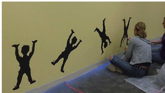
The FOL donated the paint the two volunteers used to create this cart-wheeling kid in the large meeting room downstairs.